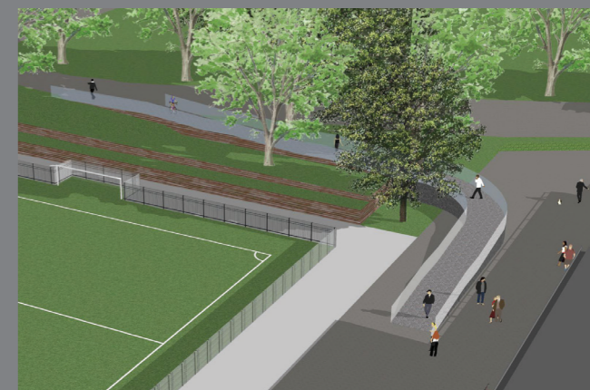
LINK TO WANDLE TRAIL