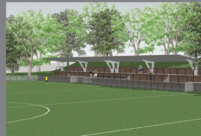
REAR PITCH SEATING